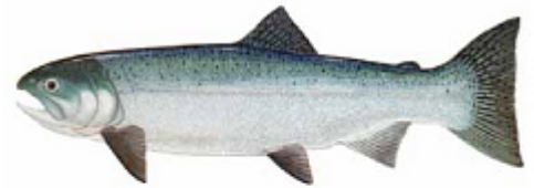
Fish oils are mostly derived from coldwater fish, salmon and trout.

These two fatty acids are metabolized to series 3 prostaglandins, which can have a significant moderating influence on inflammation. Fish, in turn, obtain EPA and DHA from algae, making super green foods such as marine micro-algae an alternate source of EPA and DHA. Algae may become the dominant source of omega-3 fatty acids as fish populations continue to decline in the world's oceans.